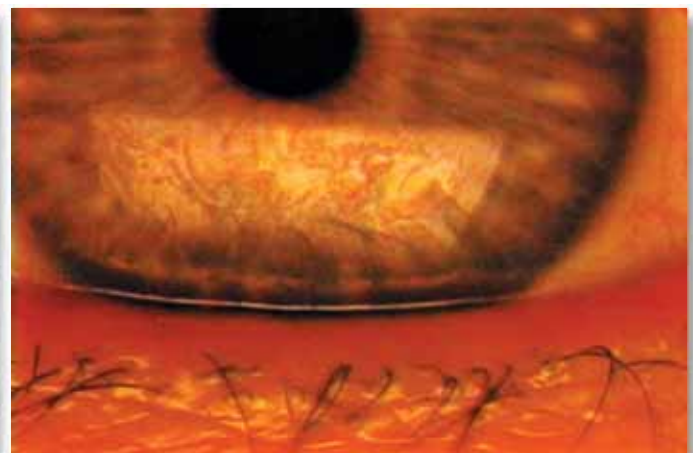
Figure 2 Fifteen minutes after the instillation of Soothe, LLT (165 nm) is optimal. The colored waves in the interference pattern of the zone of specular reflection are classified as blue/brown. Note the horizontal wave patterns.