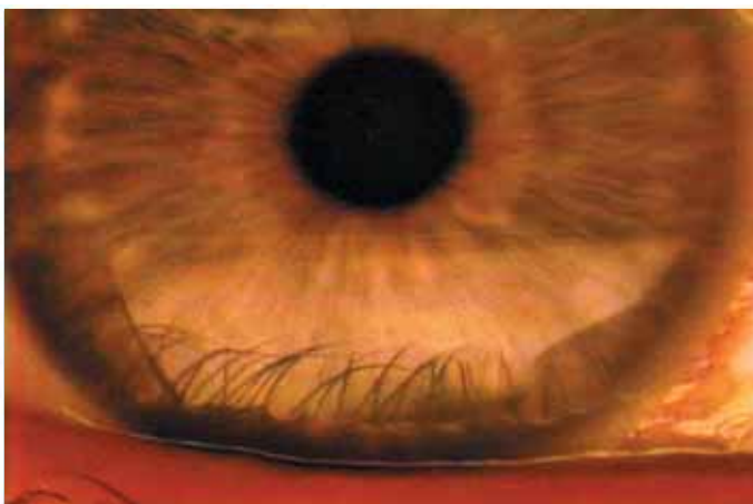
Figure 1 The baseline lipid layer thickness (LLT) prior to Soothe is 45 nm. The colored waves in the interference pattern of the zone of specular reflection are classified as gray/white.

Instillation of one drop of Soothe eye drops (Alimera Sciences) significantly increased the thickness of the lipid layer by 110% of the pretreatment value, which is critical in dry eye disease, in patients with symptoms of dry eye. In comparison, one drop of Systane (Alcon Laboratories), the second study drug, increased the thickness of the lipid layer by 18%.